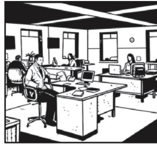
Example: an office

Write the names of the places. (5 marks)