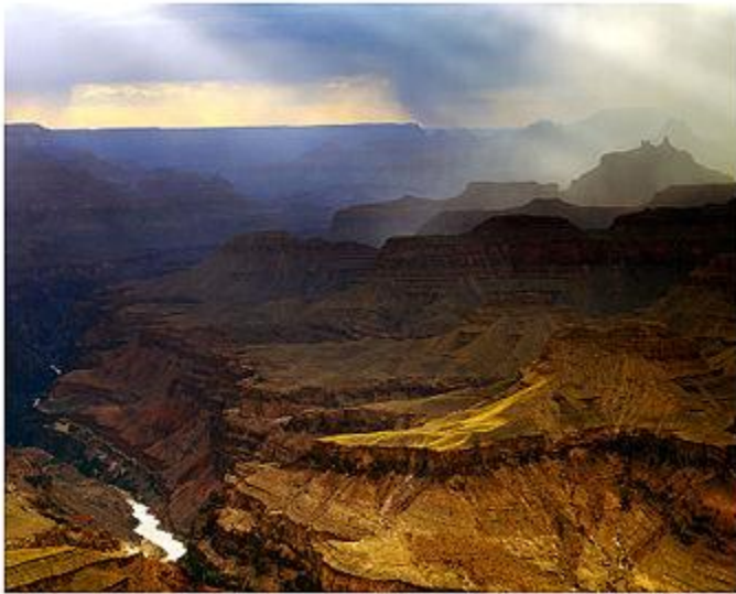
September Storm on the South Rim, 2007

The canyon, created by the Colorado River over a period of 6 million years, is 277 miles (446 km) long, ranges in width from 4 to 18 miles (6.4 to 29 km) and attains a depth of more than a mile (1.6 km). Nearly two billion years of the Earth's history have been exposed as the Colorado River and its tributaries cut their channels through layer after layer of rock while the Colorado Plateau was uplifted.