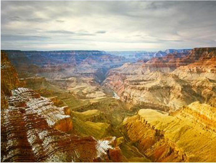
South Rim December 2006

The Grand Canyon is a colorful steep-sided gorge carved by the Colorado River in the U.S. state of Arizona. It is largely contained within the Grand Canyon National Park — one of the first national parks in the United States. President Theodore Roosevelt was a major proponent of preservation of the Grand Canyon area, and visited on numerous occasions to hunt and enjoy the scenery.