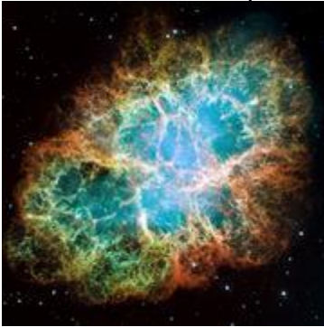
A giant Hubble mosaic of the Crab Nebula, a supernova