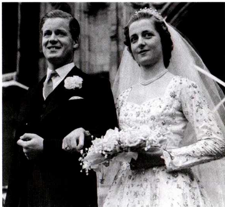
Johnnie Spencer and Frances Roche at their wedding, 1 June, 1954

Frances and Johnnie lived at Park House in Norfolk. The Royal Family had a house nearby called Sandringham House. The royals often came to Sandringham on holiday. They knew the Spencer family well.