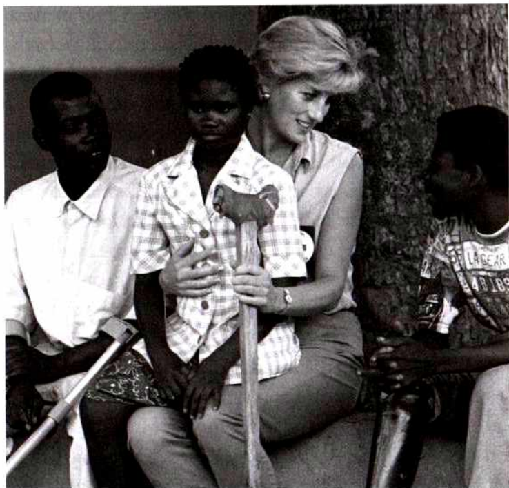
Princess Diana meets landmine victims in Angola, 15 January, 1997