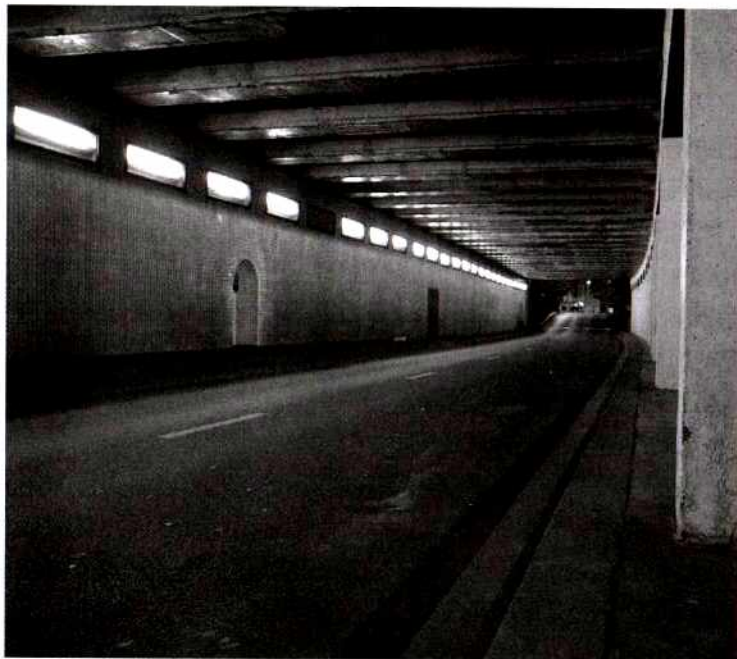
The Paris tunnel where Henri Paul's car crashed

tried to help Diana. Diana did not look badly hurt. But the injuries inside her body were terrible.