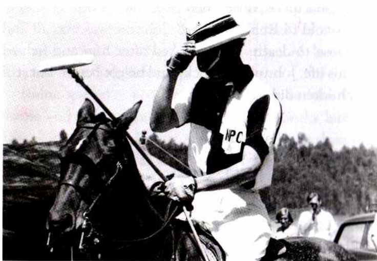
Prince Charles playing polo in Kenya, February 1971

Charles enjoyed horse riding, and loved playing polo – a game for people riding on horses. He also liked hunting and shooting animals, for example birds and deer, with a gun.