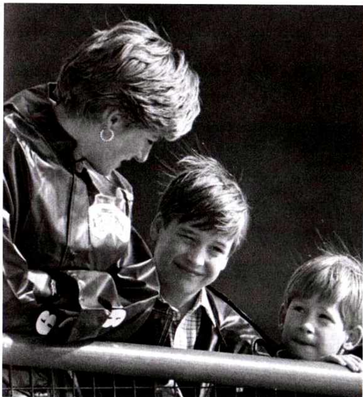
Princess Diana visiting Niagara Falls with William and Harry, 26 October, 1991

her. At a dinner on the 3rd of December 1993, at the Dorchester Hotel in London, she made a speech. She said the newspaper and television reporters made her life very difficult. She had no private life and needed more time alone. She did not want to do so many things in public. She did not want to do so much charity work.