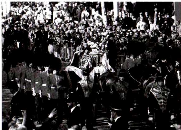
Princess Diana's funeral, 6 September, 1997

The coffin went from Kensington Palace to Westminster Abbey for the funeral. Thousands of people stood quietly by the road. Many people cried.