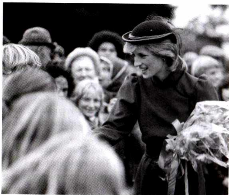
Diana meets the crowds in New Zealand, April, 1983

Later that year, Charles and Diana went on a tour of Canada. This tour was also a big success. But again, the people's favourite was Diana, not Charles. This was very difficult for Charles.