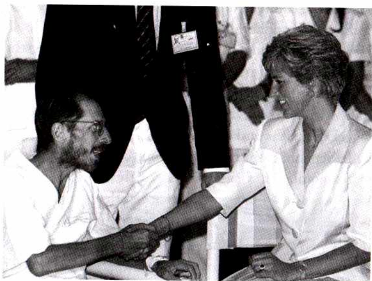
Princess Diana shakes the hand of an AIDS patient in Brazil

Now people were not just interested in Diana's clothes or hair. They were interested in her work as well.