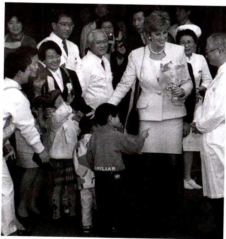
Princess Diana meets the crowds in Tokyo, February 1995

Diana also went to Italy, France, New York, Russia and Argentina. In 1994, Diana made only ten public visits. But in 1995, she made one hundred and twenty seven.