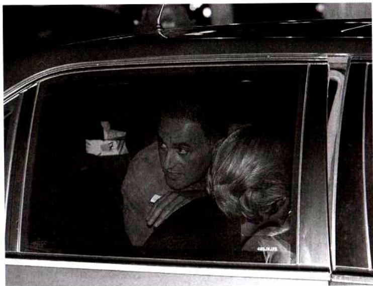
Princess Diana and Dodi in Paris

wonderful holiday together. 'Darling Dodi ...' she wrote, 'thank you for the most magical six days on the ocean waves.'