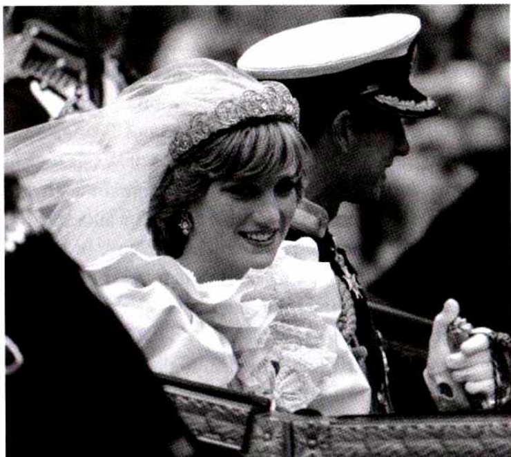
19936 Prince Charles and Princess Diana at their wedding, 29 July, 1981

working on the ship too. So Charles and Diana were not alone very much.