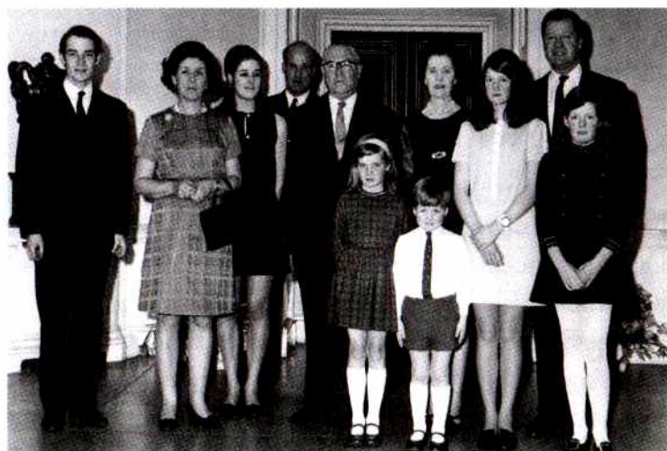
The Spencer family at Althorp House, 1969. Diana (left) and Charles are at the front of the picture

Diana's mother and father divorced in April 1969. Frances married Peter Shand Kydd soon after. Diana and her brother had holidays with Peter and his three children. Later, Frances and Peter bought a big house on the Isle of Seil. Seil was an island near the west coast of Scotland.