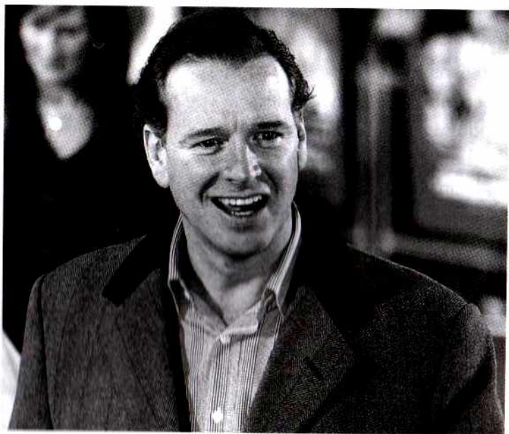
James Hewitt in London, 11 March, 2004

Diana and Hewitt met at a polo game. Hewitt was very good looking. He was kind, and could talk to women easily. He was good at listening too. Later they met again at Buckingham Palace. Diana asked Hewitt to give her horse riding lessons.