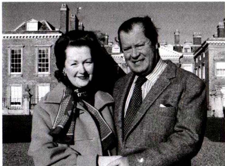
Johnnie Spencer and his second wife Raine in front of Althorp House, 1 January, 1981

Many of Raine and Johnnie's friends visited Althorp. They had a lot of parties there. But the Spencer girls were always cold to Raine. In 1978, Johnnie was very ill and was close to death. Raine looked after him and helped save his life. Johnnie was lucky and he got better. But still the children did not like Raine.