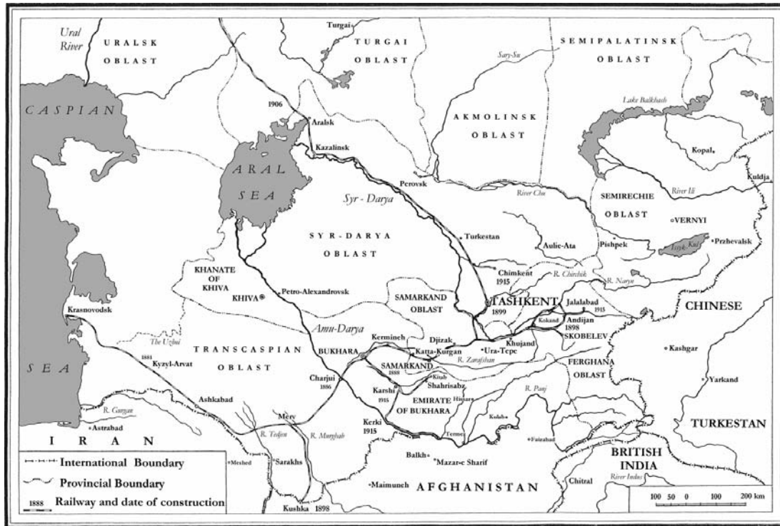
Map 1. Russian Turkestan in 1917

Adapted by the author from the map in M. G. Bakhbov et al. (eds.), Istoriya Uzbekskoi SSR , Vol. 1 Book 2 (Tashkent, 1956), facing p. 208.