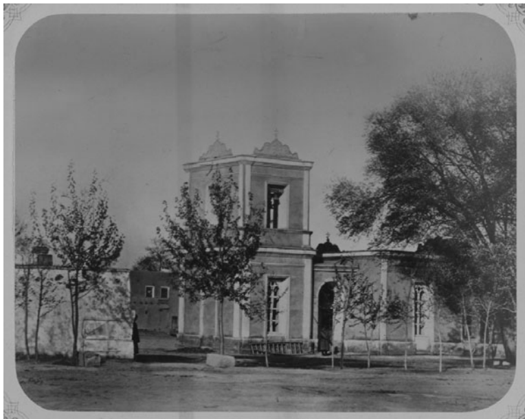
Figure 1. The Russian Orthodox Church, Samarkand.

Turkestanskii Al'bom (1871) Part 4, pl. 65, No.162.