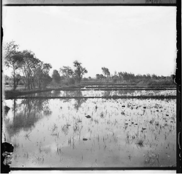
Figure 6. Rice fields near Samarkand c.1905–15.

Ref: LC-DIG-prok-11786 DLC