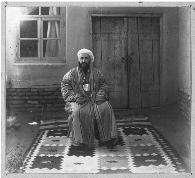
Figure 5. Aksakal , Samarkand c.1905–15.

Ref: LC-DIG-prok-02302 DLC