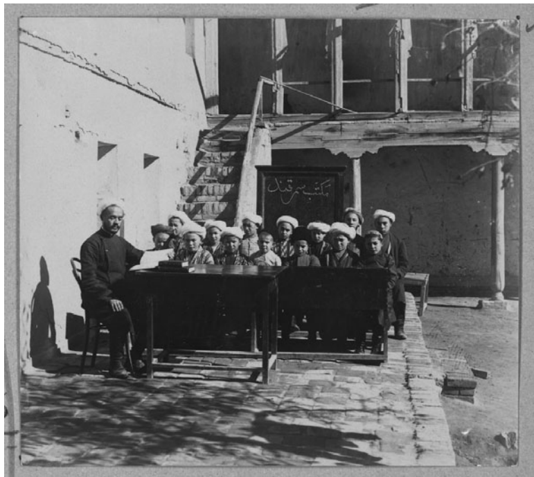
Figure 2. Sartskaya Shkola (Sart School) Samarkand c.1905–15: the blackboard and desks indicate that this is a new-method maktab . Prokudin-Gorskii Collection, Library of Congress. Ref: LC-DIG-prok-02304 DLC

The first new-method maktab in Samarkand was established by one Khoja Mahmud in 1905, but it was located in the suburban village of Kaftar Khan in order to avoid undue attention from the authorities. 112 The prominence of Tatars in the Jadid movement and the degree to which it drew the Muslims of Central Asia into closer contact with the outside world led to fears that it was a cover for Pan-Islamism and Pan-Turkism, an attitude shared even by Russian writers who were broadly sympathetic to the modernizing aims of the new-method schools. 113