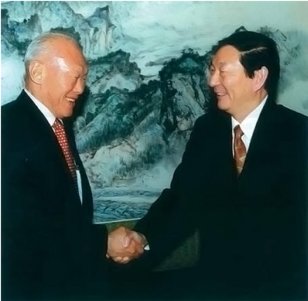
September 1999. With Chinese Premier Zhu Rongji at Zhongnanhai, Beijing. (LKY)