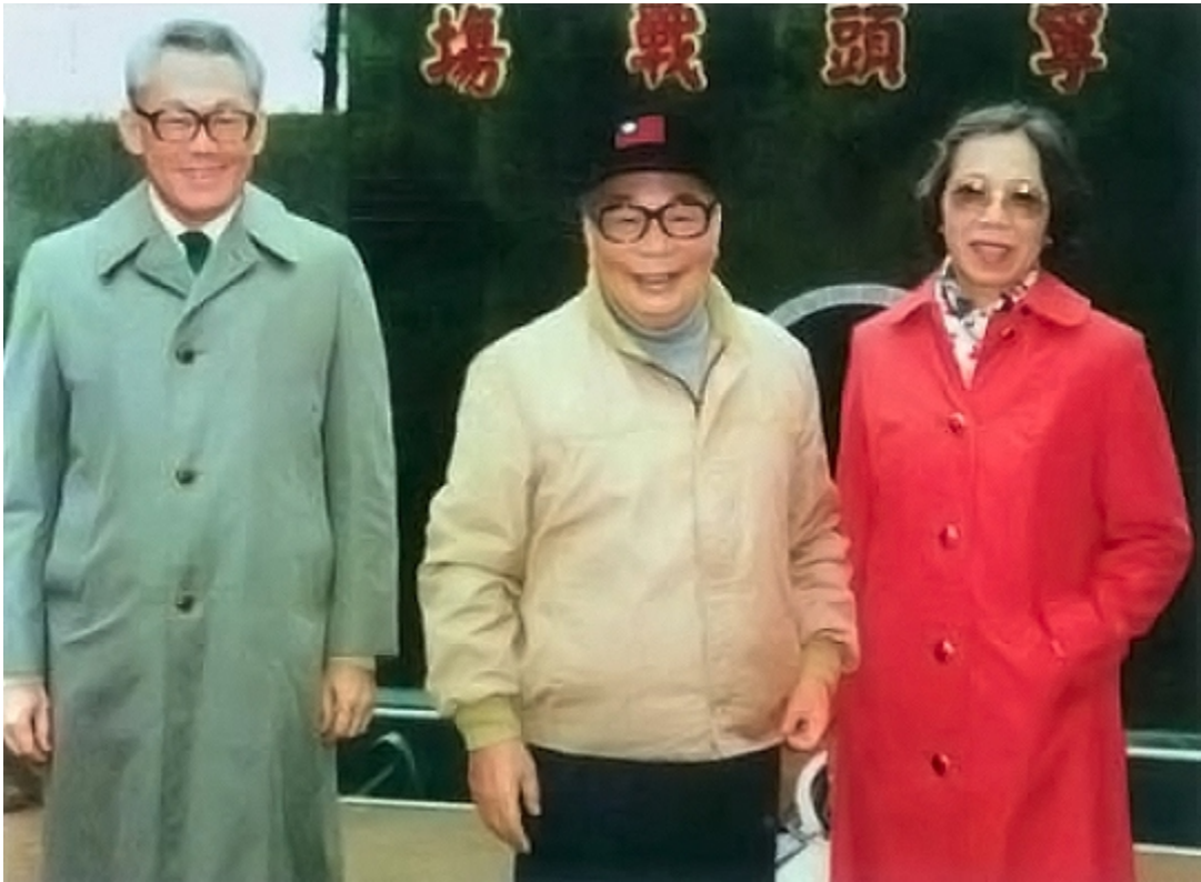
February 1981. On Quemoy, an island opposite Xiamen (Amoy) with President Chiang Ching-kuo.