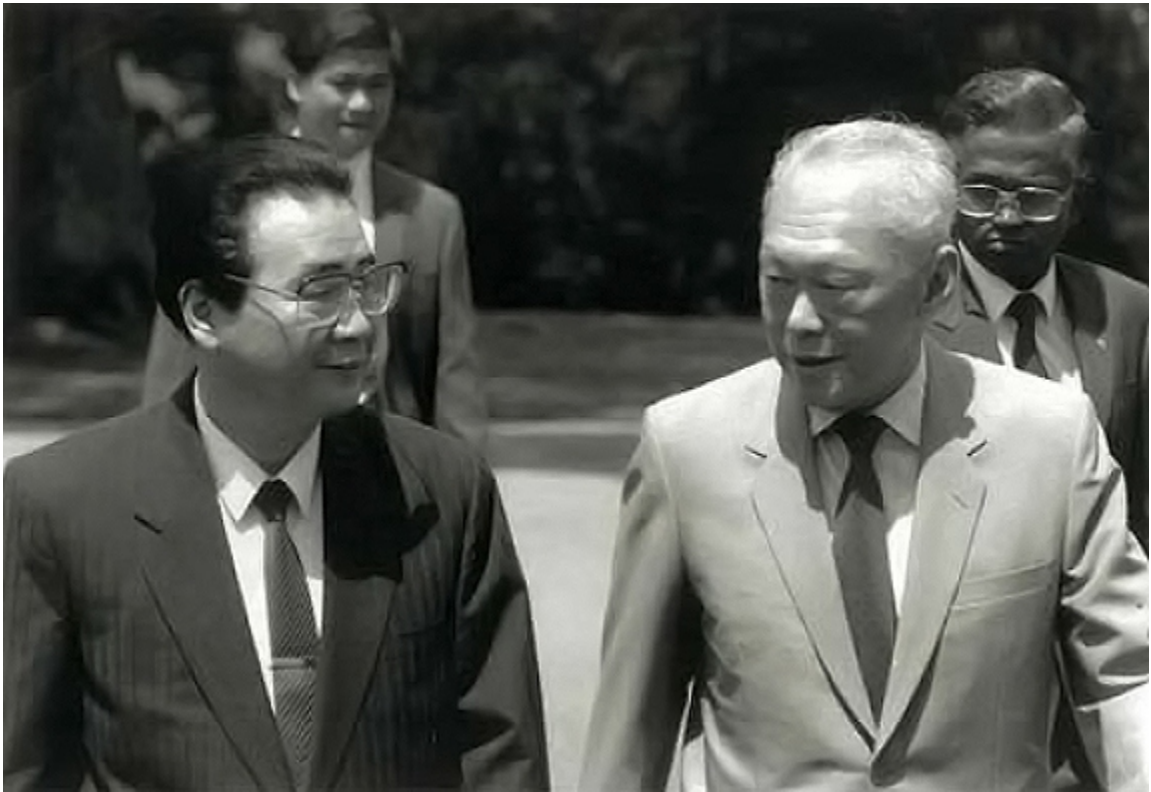
August 1990. Receiving Chinese Premier Li Peng at the Istana.