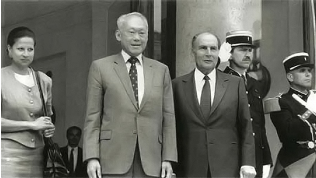
November 1990. President Francois Mitterrand at the door of the Elysée Palace, Paris.