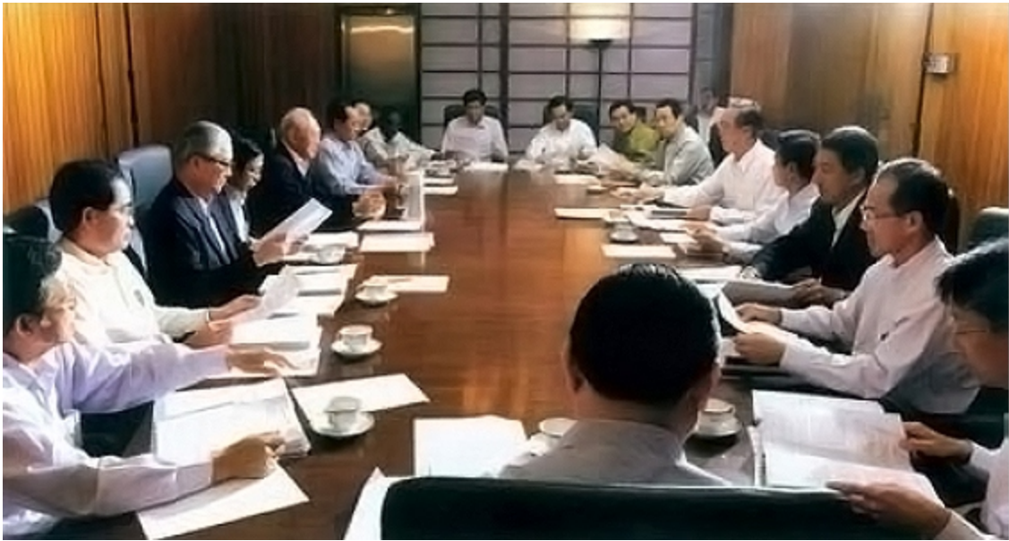
September 1999. Cabinet meeting with Prime Minister Goh Chok Tong in the chair.