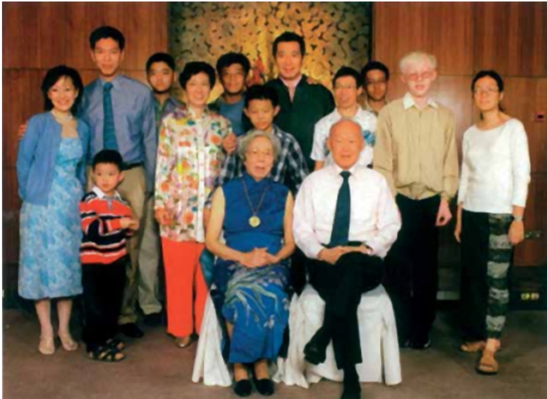
Family reunion Chinese New Year's eve, 4 February 2000. (SPH/Straits Times)