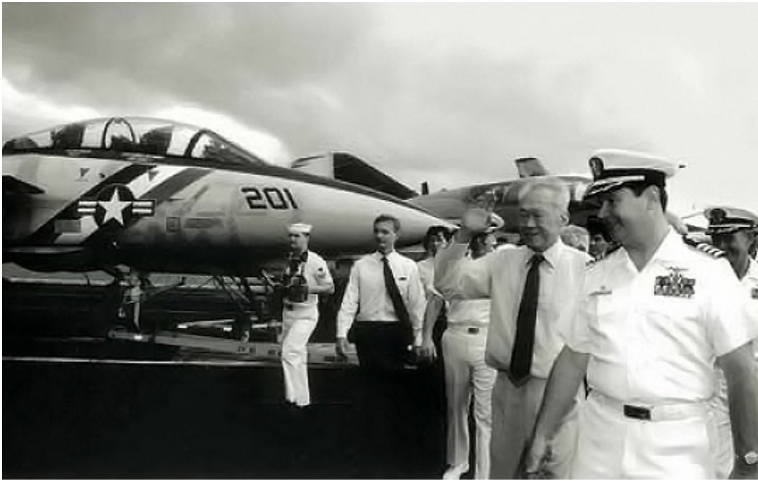
April 1989. Visiting US aircraft carrier USS Ranger in Singapore harbour.