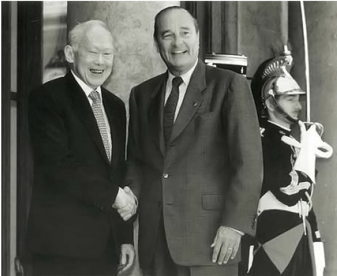
May 1999. President Jacques Chirac greeting me at the door of the Elysée Palace, Paris.