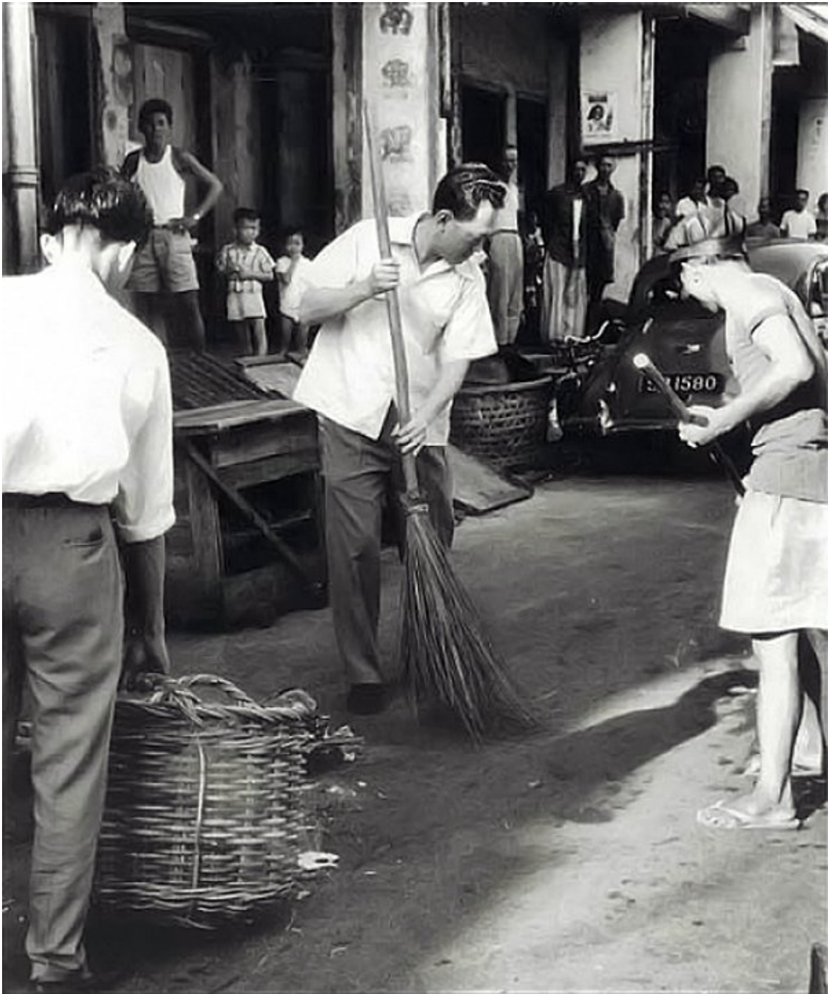
November 1959. Beginning one of many campaigns to keep Singapore clean.