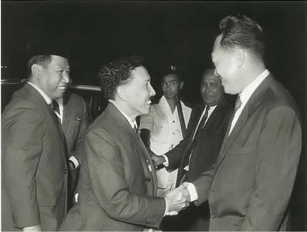
April 1964. Greeting Sultan of Brunei Sir Omar Ali Saifuddin at Singapore airport.