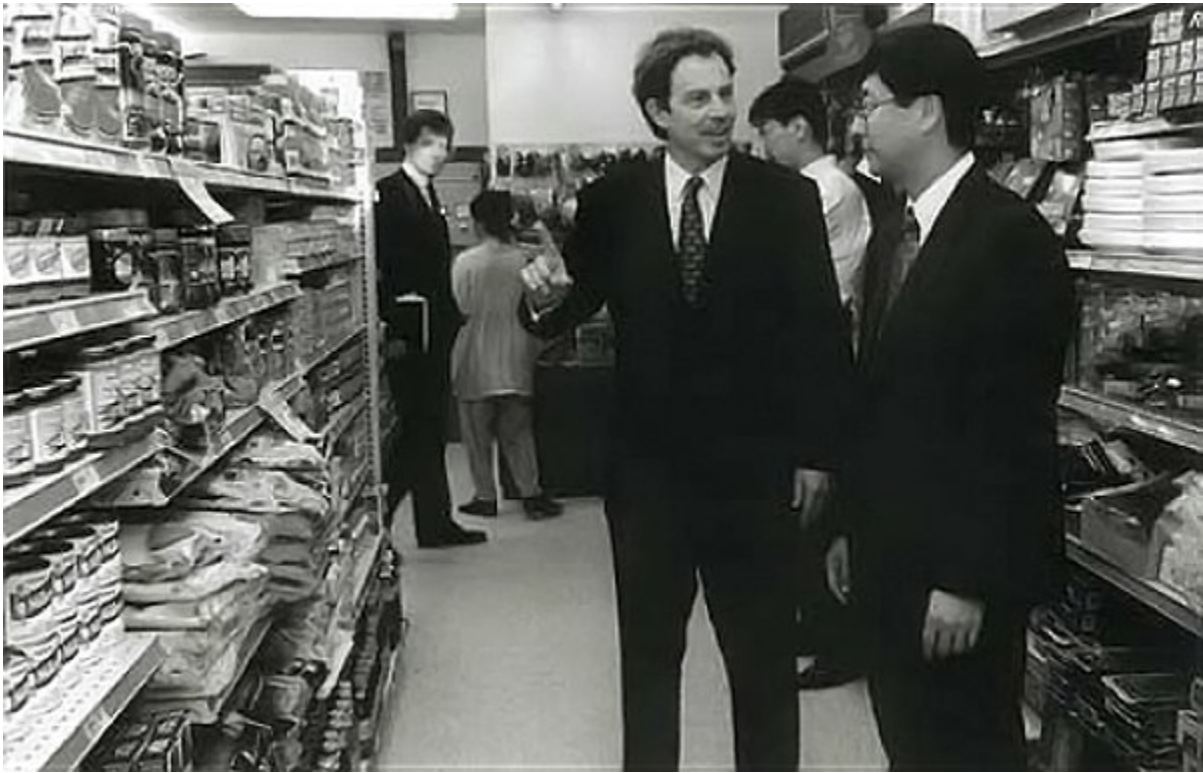
January 1996. British Labour Party leader Tony Blair accompanied by Lim Boon Heng, NTUC secretary-general, visiting one of our NTUC supermarkets, similar to those visited by Russian Premier Nikolai Ryzhkov and Vietnamese Party Secretary Do Muoi.