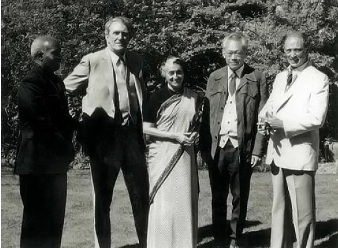
October 1981. Commonwealth leaders' "retreat" in Canberra. (From left) Kenneth Kaunda (Zambia), Malcolm Fraser (Australia), Indira Gandhi (India), myself and Pierre Trudeau (Canada). (LKY)