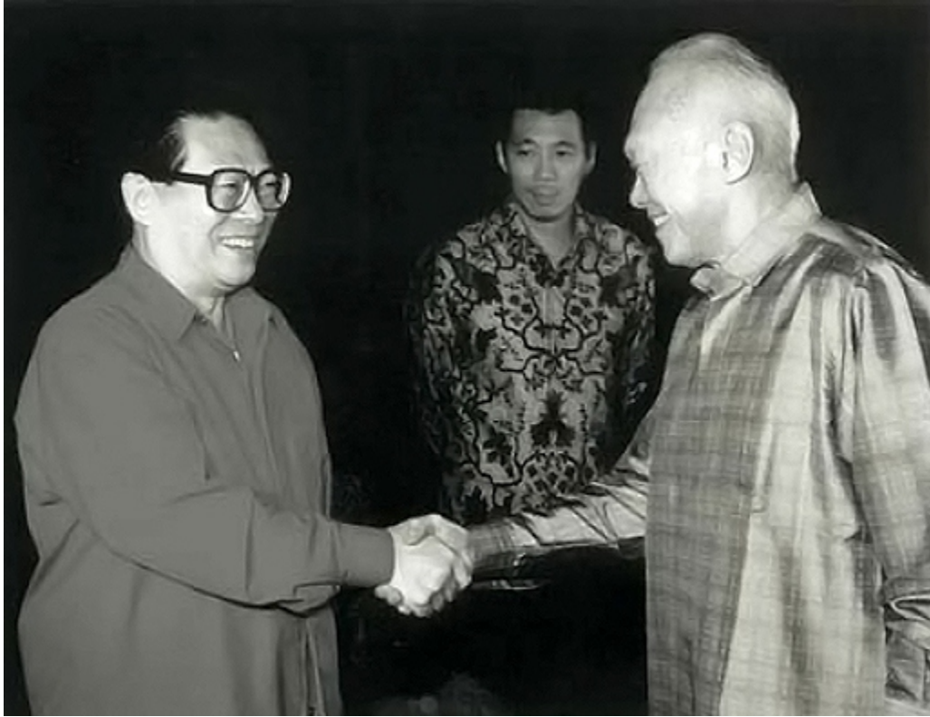
November 1994. With Jiang Zemin at an Istana poolside barbecue dinner. Loong is in the background.