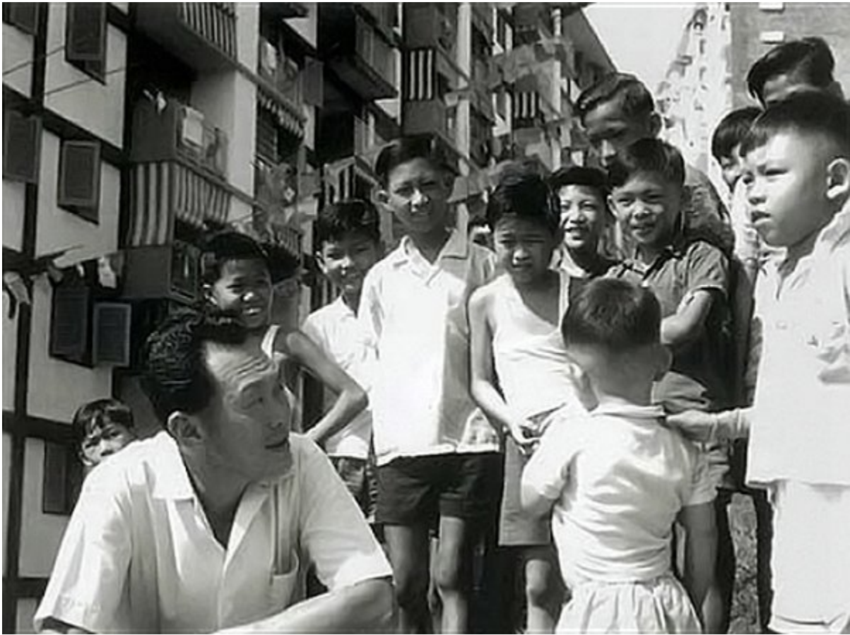
1965. Visiting Bukit Ho Swee residents resettled in high-rise flats, four years after a huge fire there razed a squatter colony.