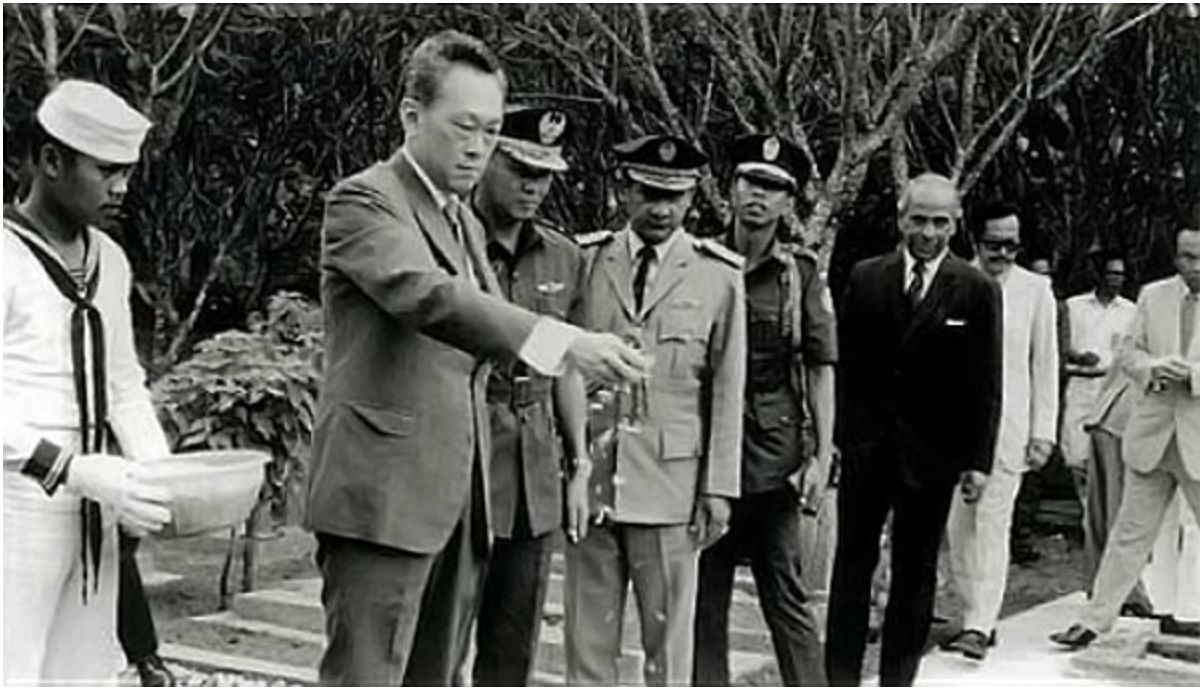
May 1973. My first official visit to Suharto's Indonesia - scattering flowers on the graves of two Indonesian marines executed in Singapore in 1968 for terrorist murders in 1965. (SPH)