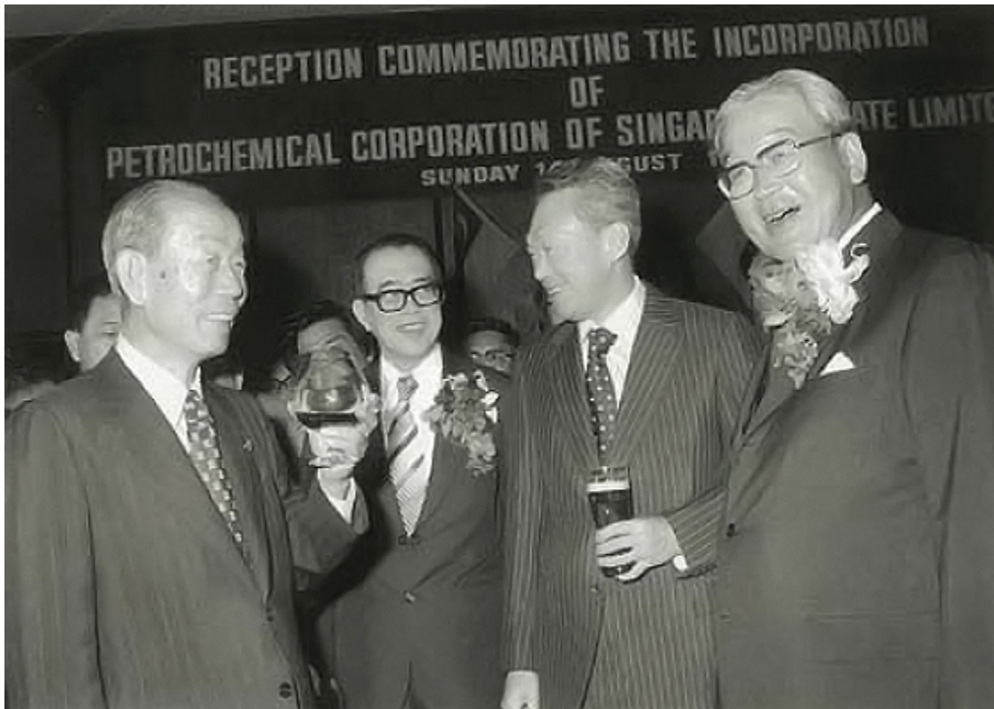
Japanese Prime Minister Takeo Fukuda, Hon Sui Sen, myself and Norishige Hasegawa, the Sumitomo chairman, celebrate the launching of Petrochemical Corporation of Singapore in August 1977.