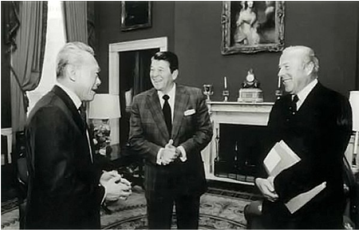
August 1982. Meeting with friends President Ronald Reagan and US Secretary of State George Shultz.