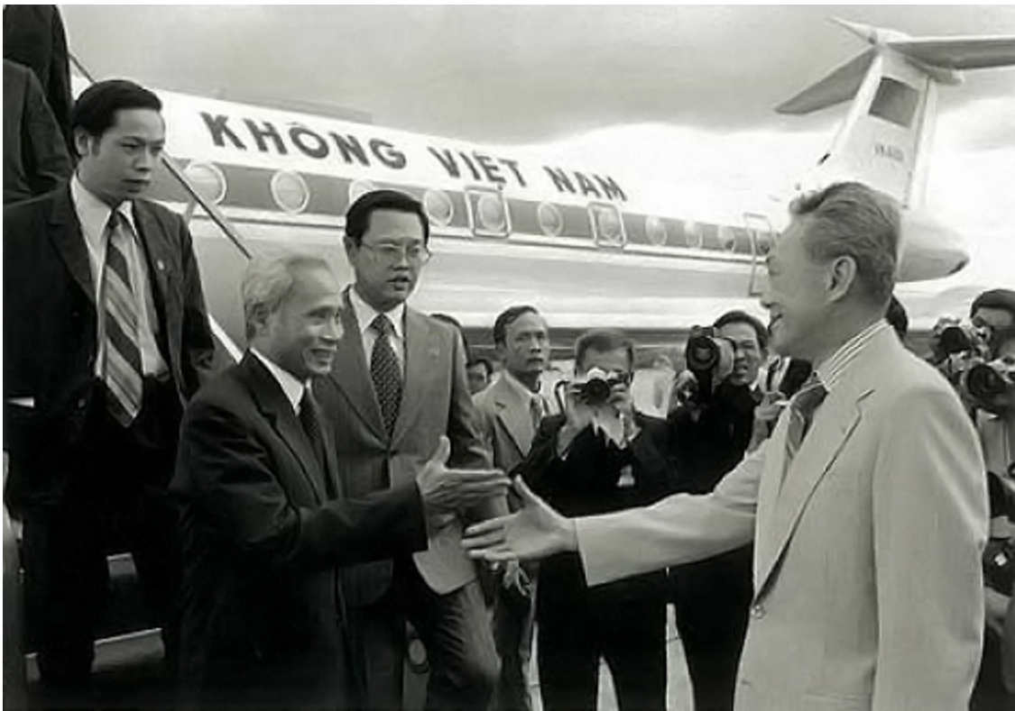
Meeting Vietnamese Prime Minister Pham Van Dong at Singapore airport in October 1978, before frosty discussions.