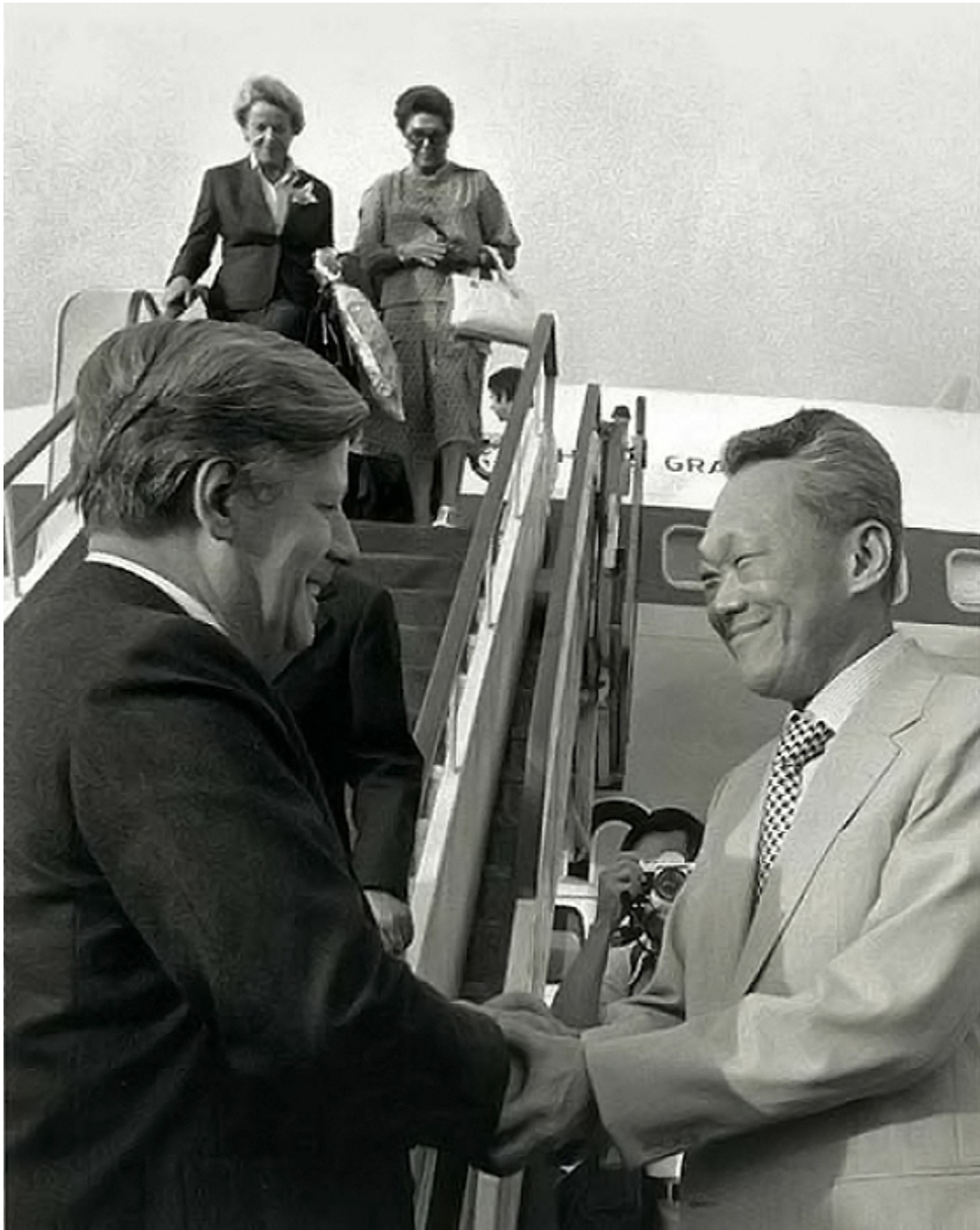
Welcoming German Chancellor Helmut Schmidt in October 1978.