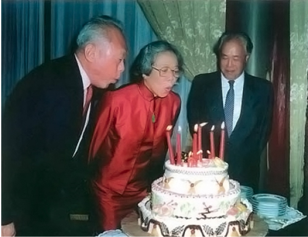
September 1988. Chinese Communist Party Secretary Zhao Ziyang hosting dinner at Diaoyutai, Beijing on my 65th birthday. (LKY)