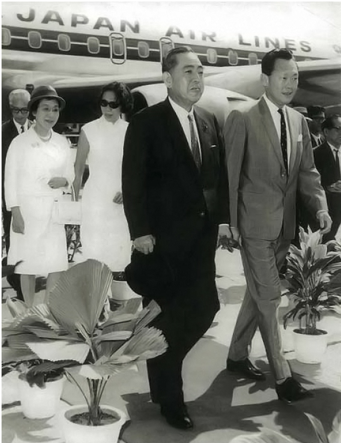
September 1967. Welcoming Japanese Prime Minister Eisaku Sato and Mrs Sato in Singapore.