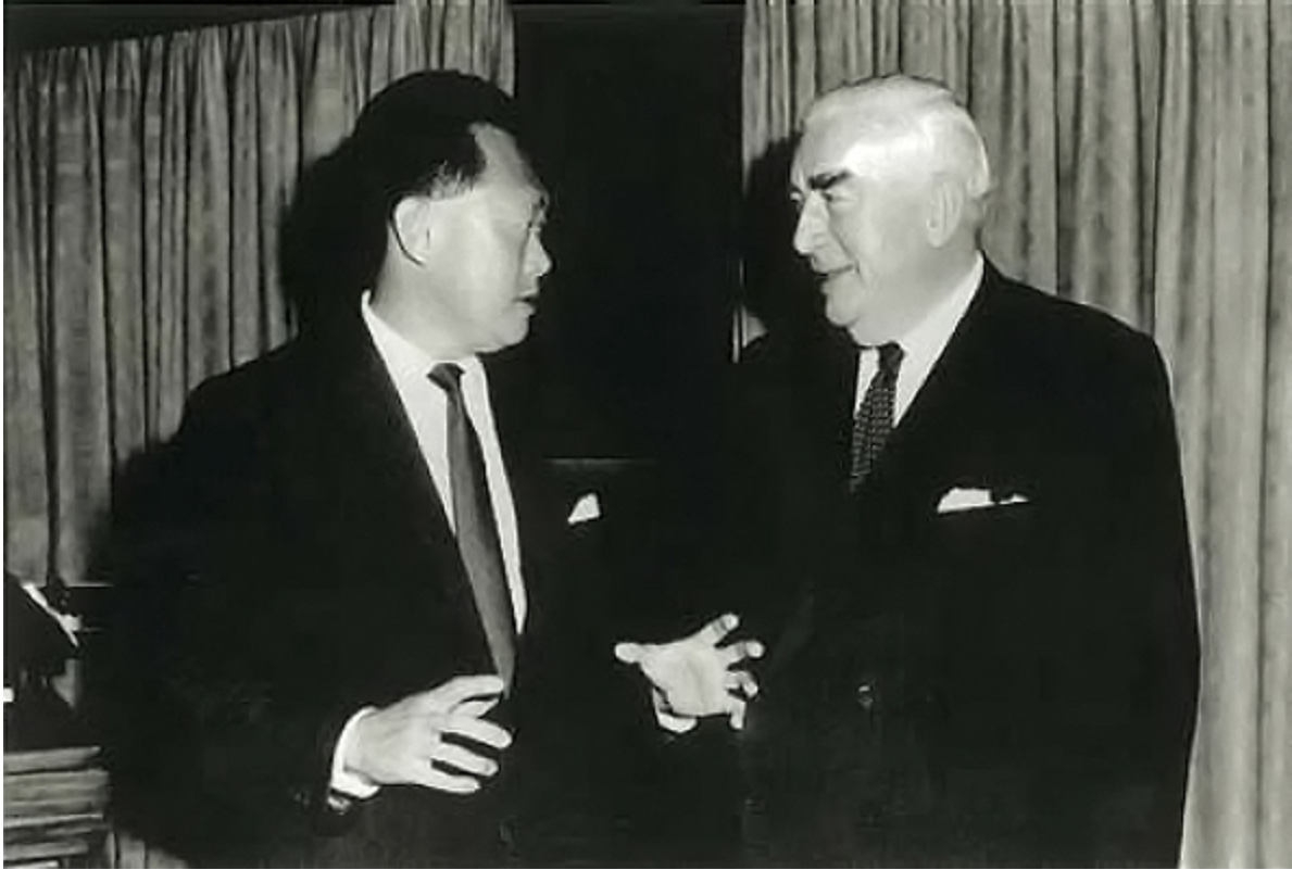
April 1965. With Prime Minister Robert Menzies in Parliament House, Canberra. (LKY)