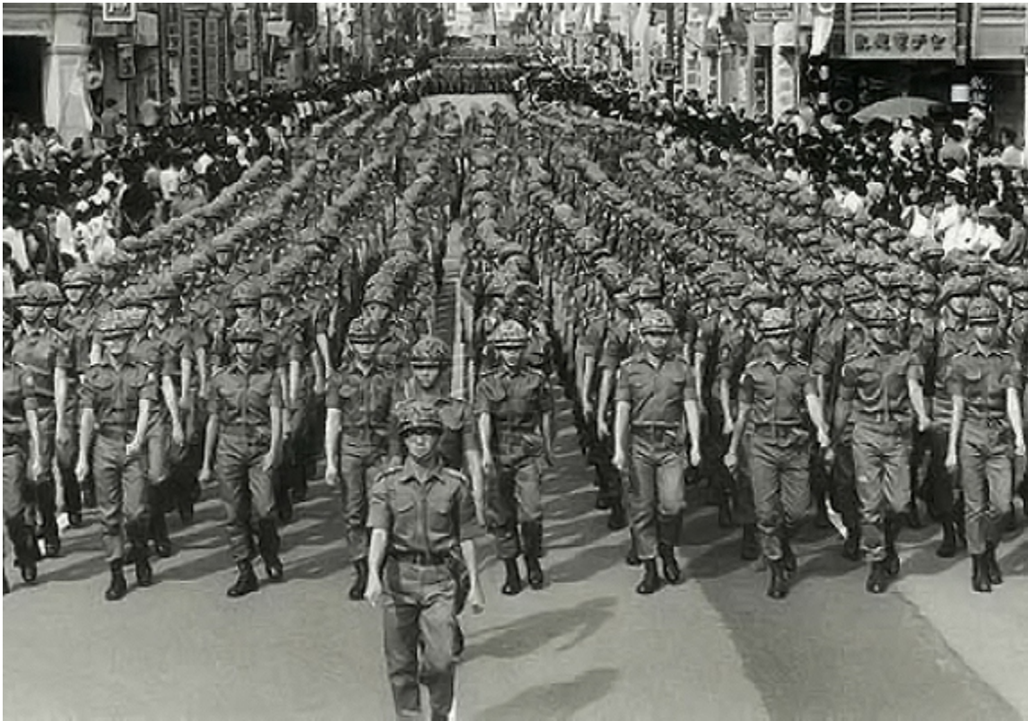
National Day Parade, August 1971. The SAF marching through North Bridge Road to boost morale. Loong as officer cadet is second in extreme left row. (LKY)