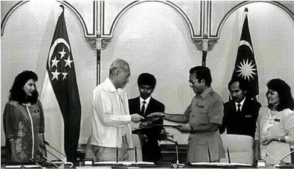
June 1988. A major agreement with Prime Minister Mahathir in Kuala Lumpur to build the Lingui dam on the Johor River.