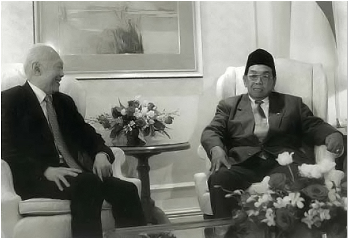
November 1999. Calling on newly elected Indonesian President Abdurrahman Wahid at his Singapore hotel.