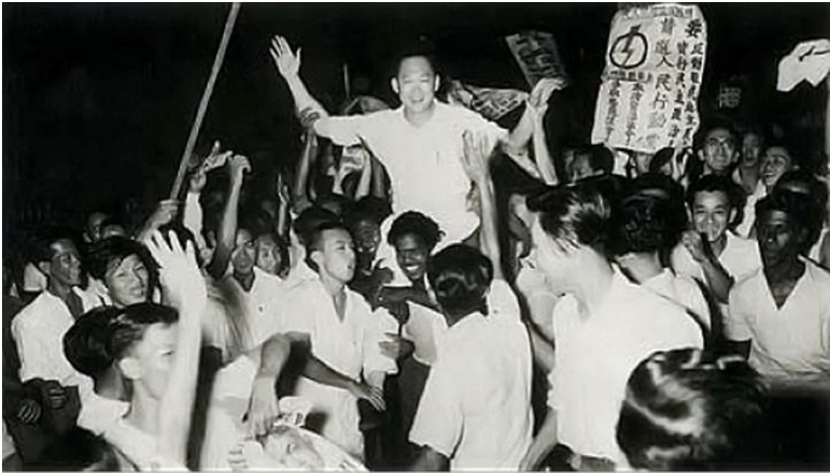
April 1955. My first election victory in Tanjong Pagar, which I represent 45 years later in 2000.