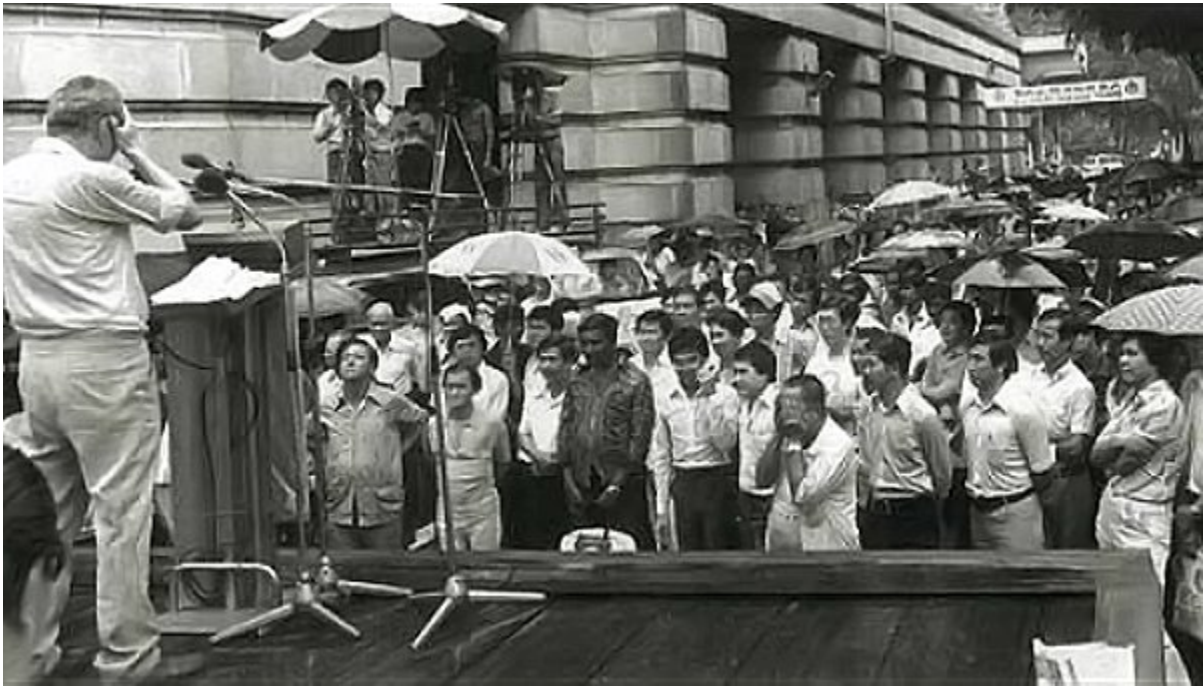
December 1980. Speaking in the rain for one hour because the crowd stayed on.