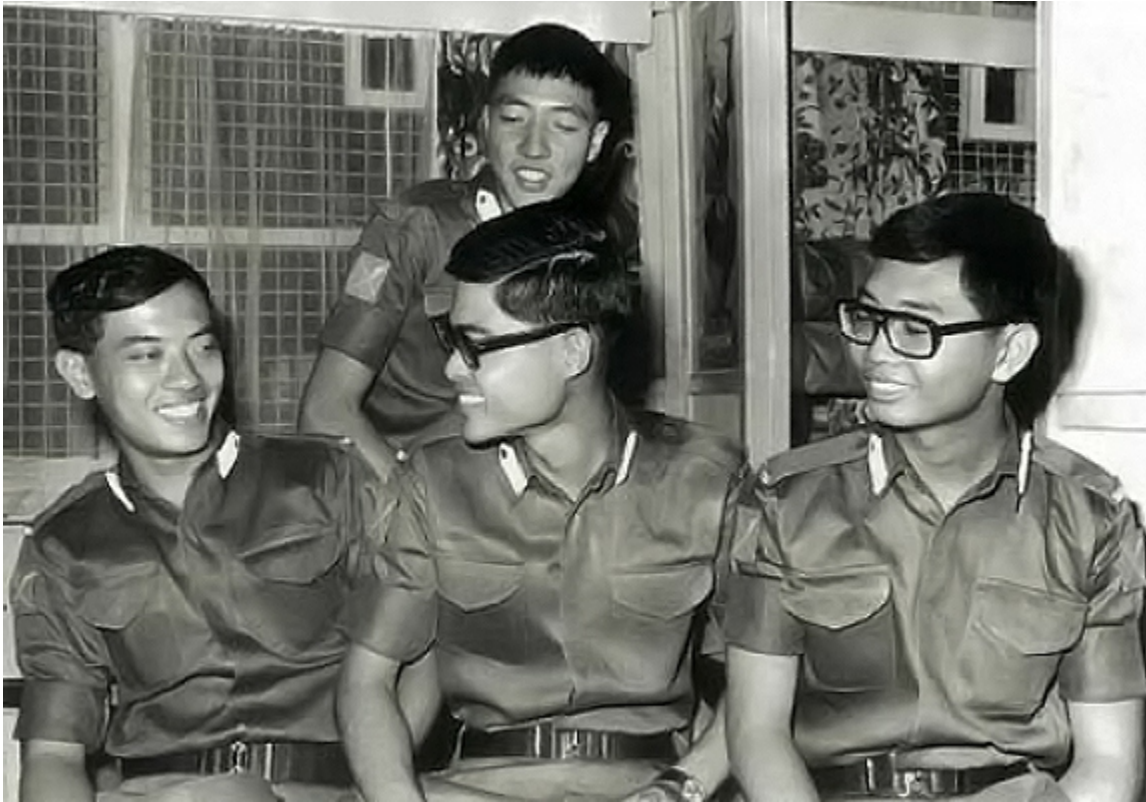
June 1973. Four SAF scholar officer cadets of whom three are now cabinet ministers: (top) Teo Chee Hean, (front left and centre) George Yeo and Lim Hng Kiang.