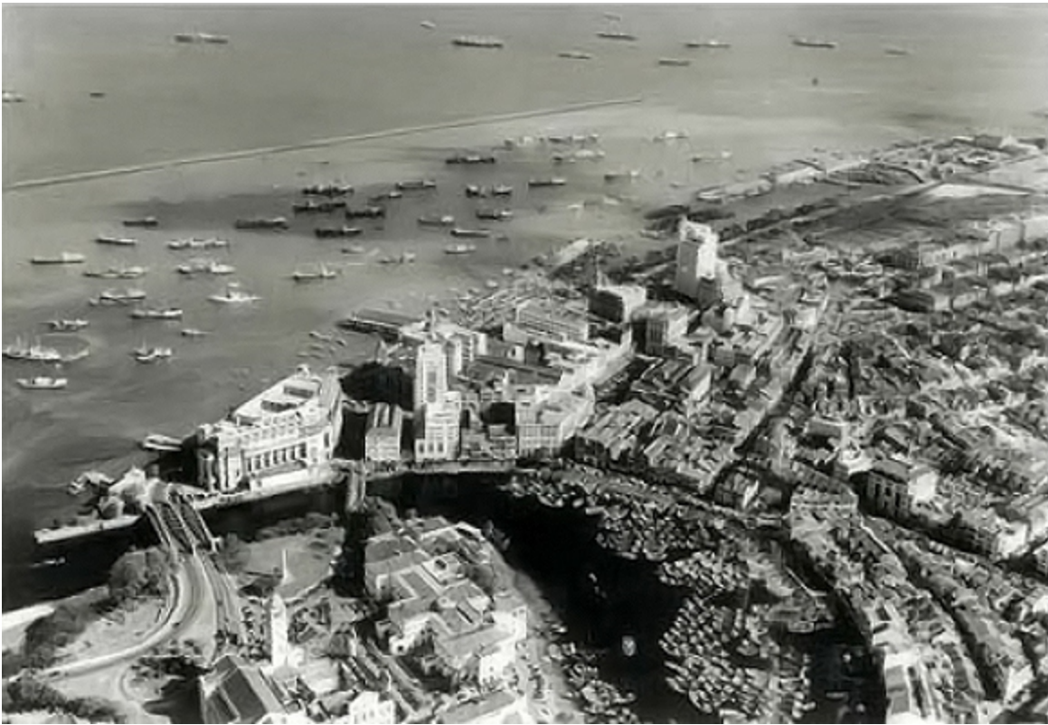
1950s. Colonial outpost.