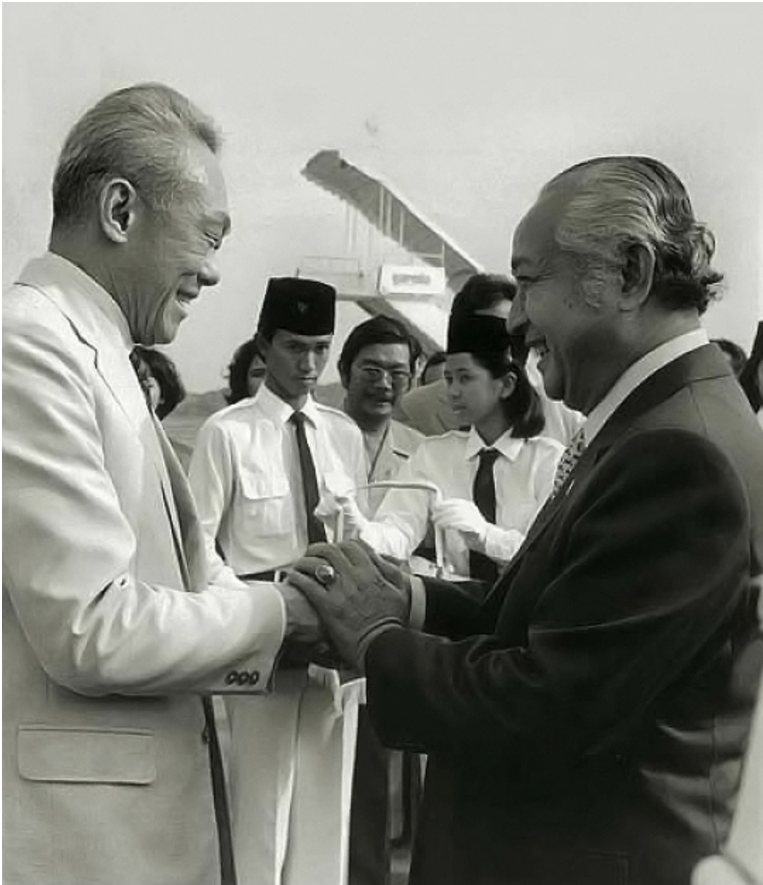
September 1982. President Suharto greeting me at Jakarta airport.