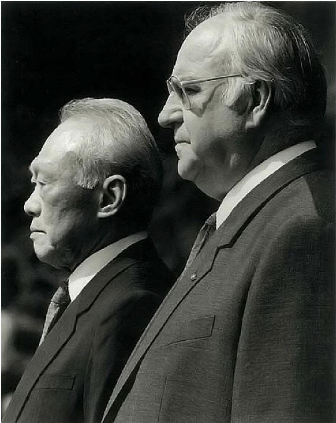
May 1990. With German Chancellor Kohl at welcoming ceremony in Bonn.