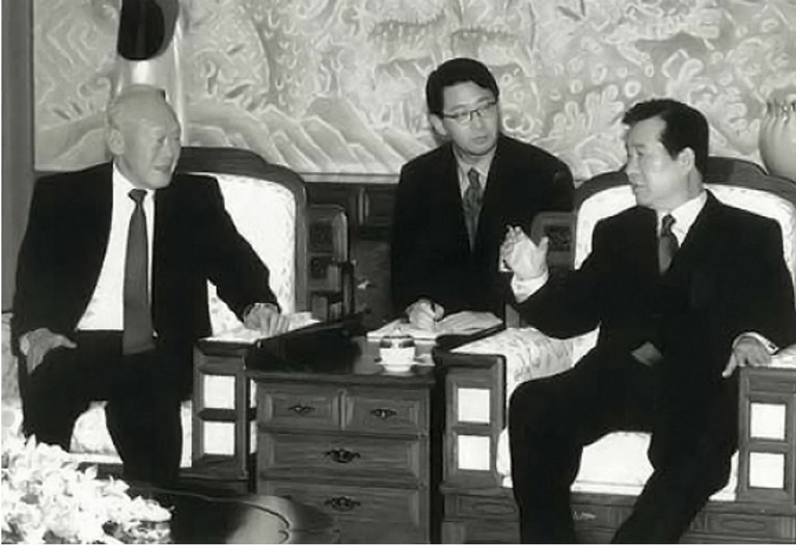
October 1999. With President Kim Dae Jung at the Blue House in Seoul.