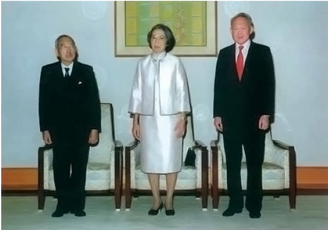
October 1986. Formal picture taken with Emperor Hirohito of Japan. (LKY)