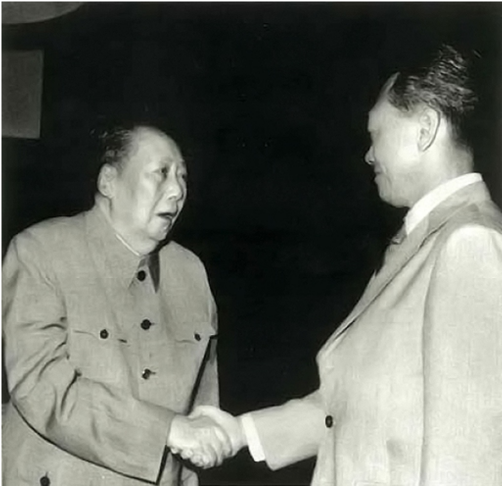
May 1976. Meeting Chairman Mao Zedong in Beijing's Zhongnanhai, a residential enclave for China's leaders.