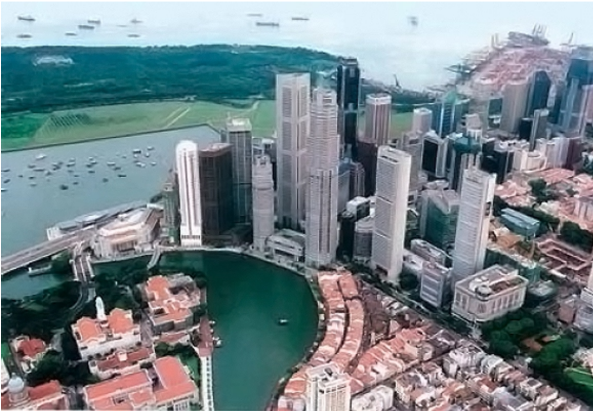
2000. Financial/business hub with reclaimed land and container wharves in the background.