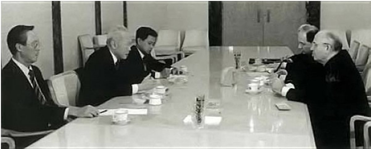
September 1990. Goh Chok Tong, Wong Kan Seng and me meeting a harassed President Mikhail Gorbachev in the Kremlin.