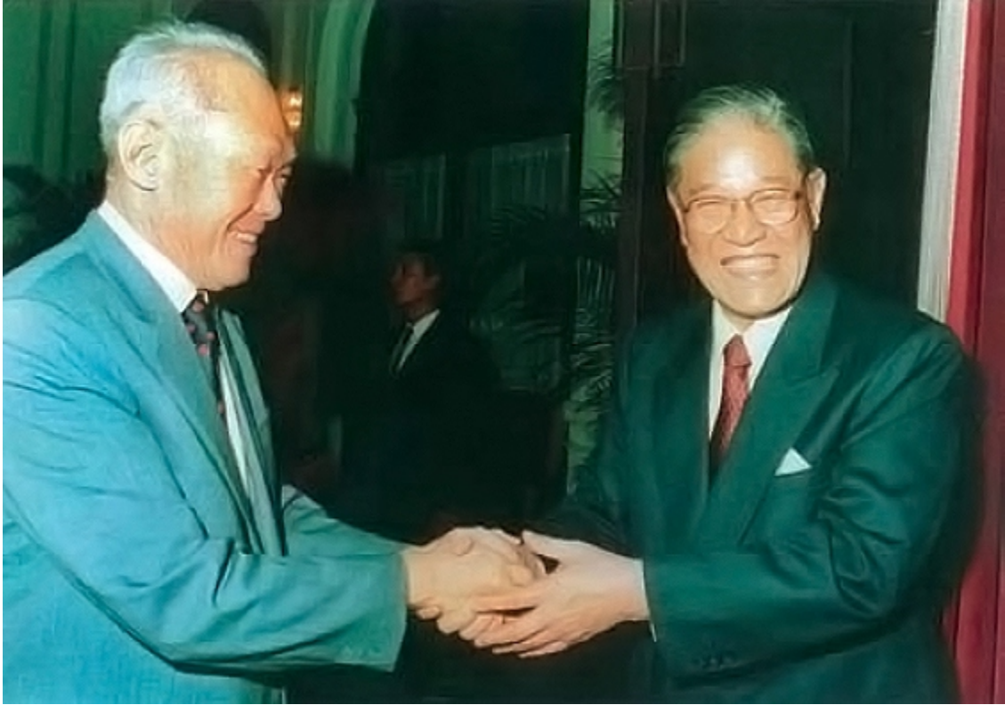
January 1990. President Lee Teng-hui receiving me in Taipei. (LKY)